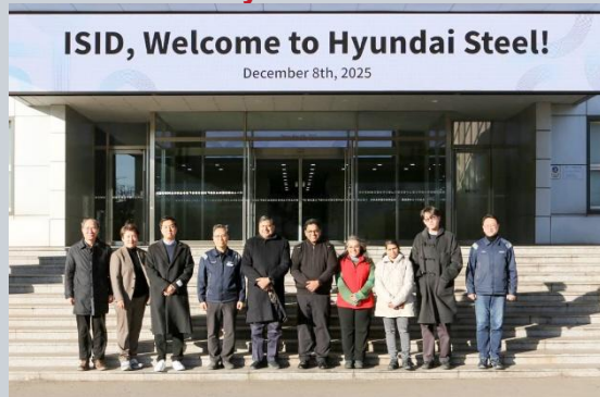
ISID faculty members along with KIET team on an industry visit to Hyundai Steel in Dangjin on December 8, 2025