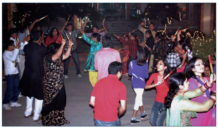
Family members of all campus institutions playing Dhandia during Diwali celebrations

Demonstration of the RRCD was given at a stall put up by ISID during the 93<sup>rd</sup> Annual Conference of the Indian Economic Association held during 27–29 December 2010, at Panjab University, Chandigarh. The response to the RRCD was very encouraging.