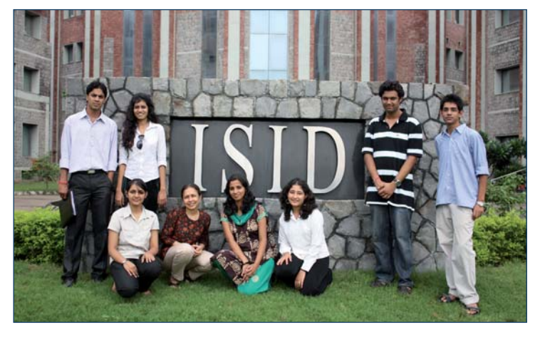
IYCN Eco-Audit team

To pursue this idea further, an organising committee was constituted, comprising members from all these institutions. It was unanimously decided to have Diwali Celebrations in the form of a Mela sponsored and organised jointly by all four