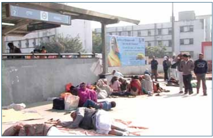
A shot from the documentary (Taken outside AIIMS)

Using case studies and interviews with patients, policy makers, academics, NGOs, advocates and medical professional, the film aims to raise a debate on how the big private or corporate hospitals take full advantage of government grants and subsidies and continue making huge profits without fulfilling their promises and obligations. The hospitals claim that poor patients don't come to them or are not referred to them. Why is that so? Is it due to lack of awareness? Are the documentation