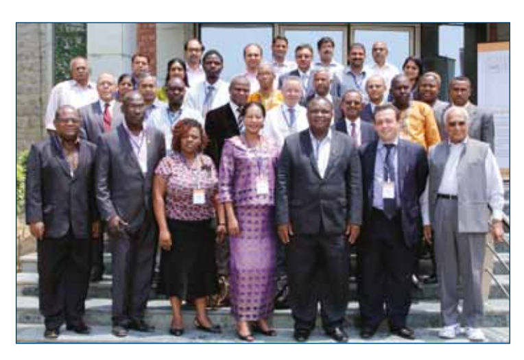
A group photo of the delegation for the "India-Africa Policy Dialogue on Pharmaceuticals", 30 April 2013