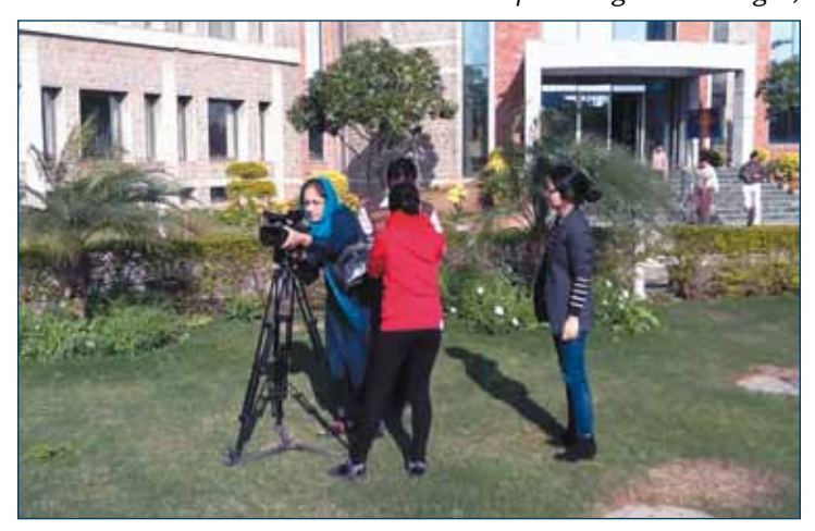
Participants handling the camera equipment during their practical session