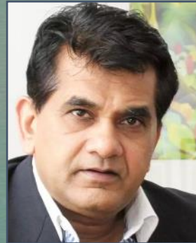
Mr Amitabh Kant CEO, NITI Aayog, Government of India